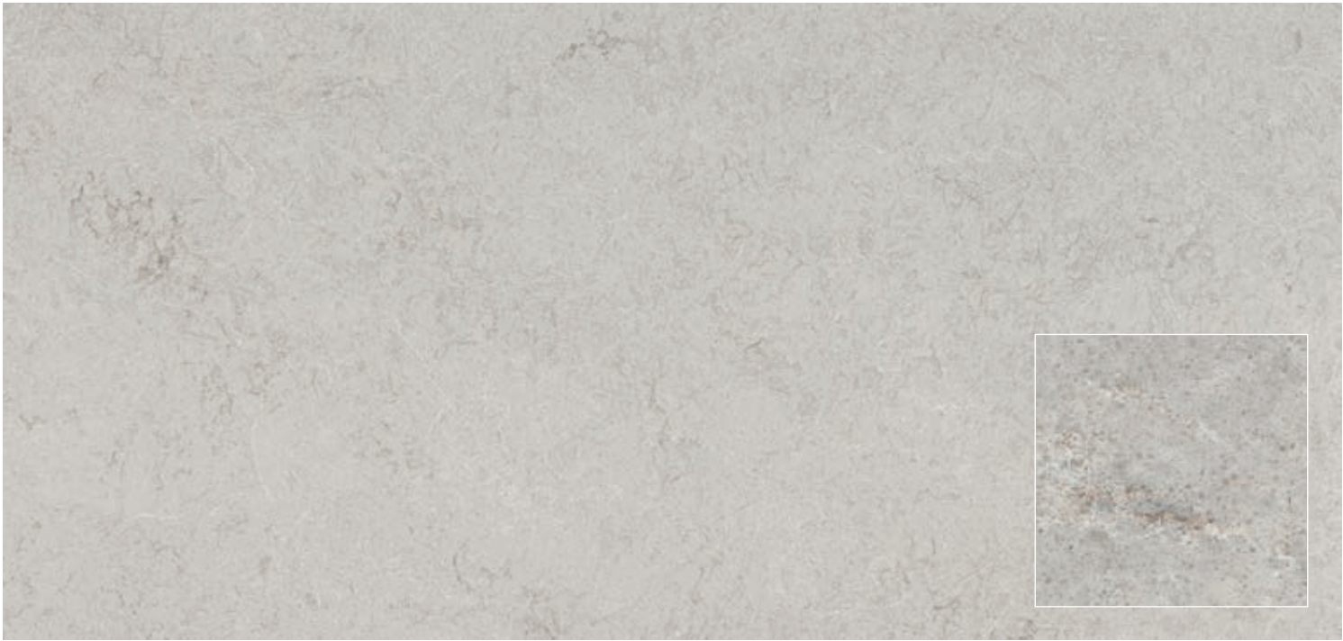
Insets show pattern at 100% scale

Inspired by light natural granites, Bianco Drift incorporates the subtle colourations of light grey and white with a hint of light brown bringing this stunning design to life.