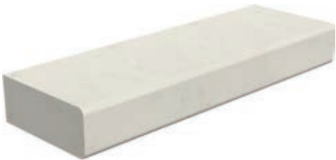
Standard Pencil Edge with 3-4mm Radius

Caesarstone recommends a minimum radius of 3-4mm on any edge detail for optimal strength and durability. There are many edge profiles to choose from, including single thickness 20mm or 30mm slabs, through to mitred aprons.