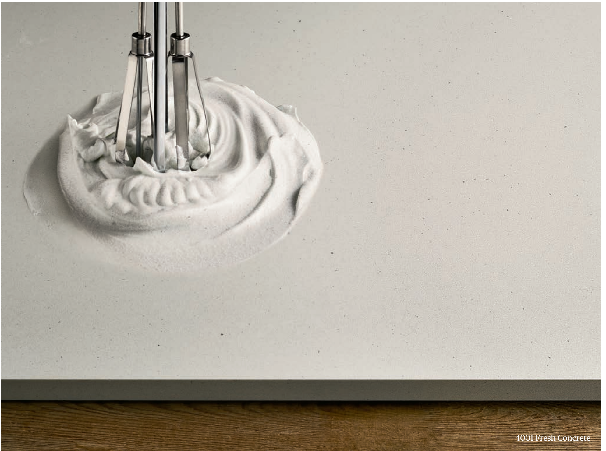
4001 Fresh Concrete

Perfectly imperfect. Designed to replicate the genuine article, these stunning concrete colours feature all the inclusions and imperfections you'd expect to see in real concrete.